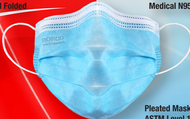
Pleated Masks, ASTM Level 1, 2 and 3