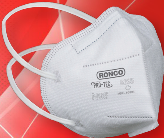
Particulate Filtering Medical N95 Respirator, Vertical Folded