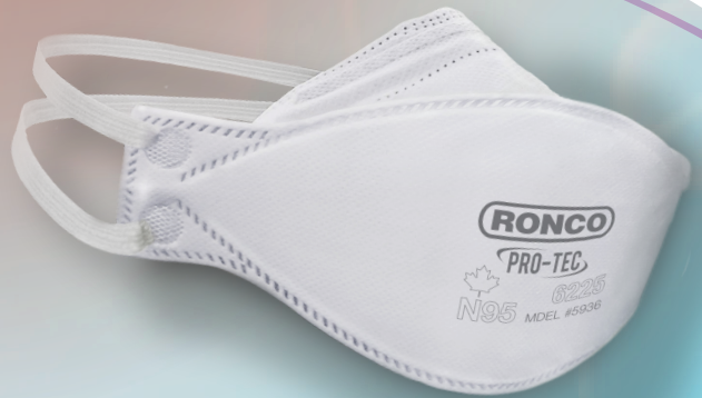
Particulate Filtering Medical N95 Respirator, Flat Folded